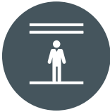
METAL SUSPENDED CEILINGS