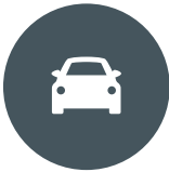
EXCELLENT PARKING RATIO OF 1:241 SQ FT