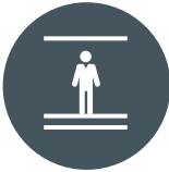
FULL ACCESS RAISED FLOORS