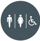
MALE, FEMALE & DISABLED WC'S