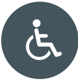
FULLY DDA COMPLIANT